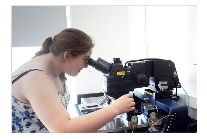
Figure 2: A student researcher operates a Cascade EPS150FA probe system to acquire data on the electrical behavior of newly synthesized materials.

"The EPS150FA probe station is capable of probe tip placement down to a resolution of 30 µm."