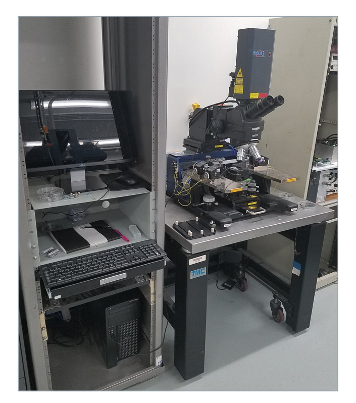
Figure 3: EPS150FA in the School of Engineering at Brown University laboratory.

"The EPS150FA system flexibility lets the team mount a laser cutter from New Wave Research to perform micromachining operations."