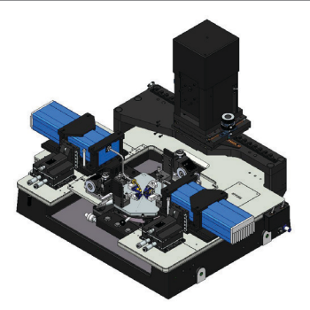
SIGMA option (EPS-ACC-150MMW-WG) with EPS-ACC-150MMW-4P enables a 4-port waveguide setup