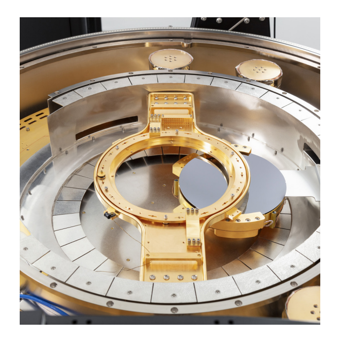
Wafer Exchange Cooldown