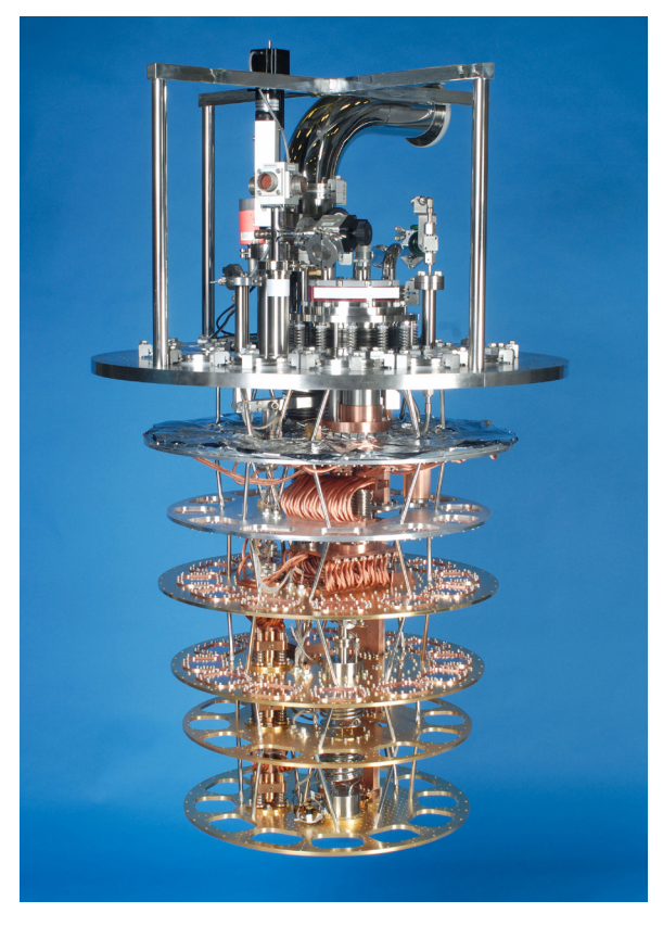
JDry-500 Cryogen-Free Dilution Refrigerator

The JDry-500 model is fitted with a cold-plate of 508 mm (20″) diameter, and provides a cooling power of more than 450 \mu W at 100 mK.