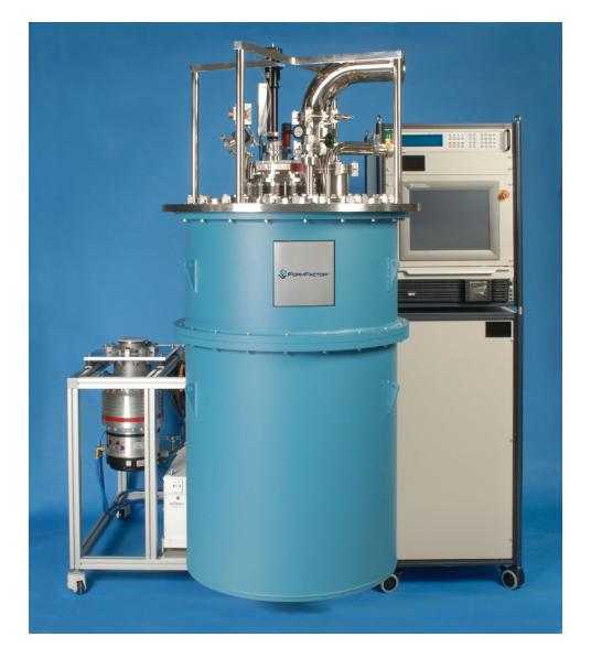
JDry-500 with JACoB GHS and Pump