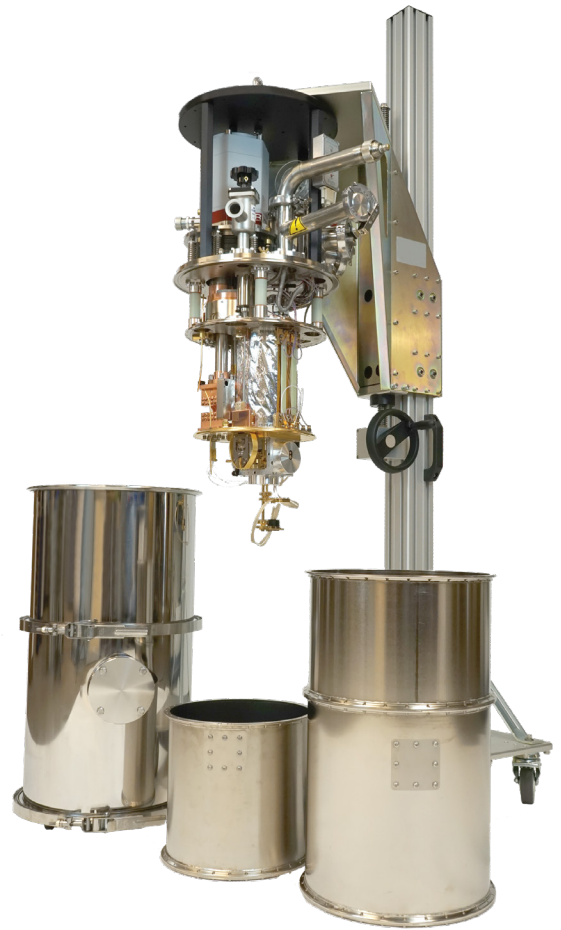
Typical Rainier 103 RCC with customer wiring on Atlas Service Stand