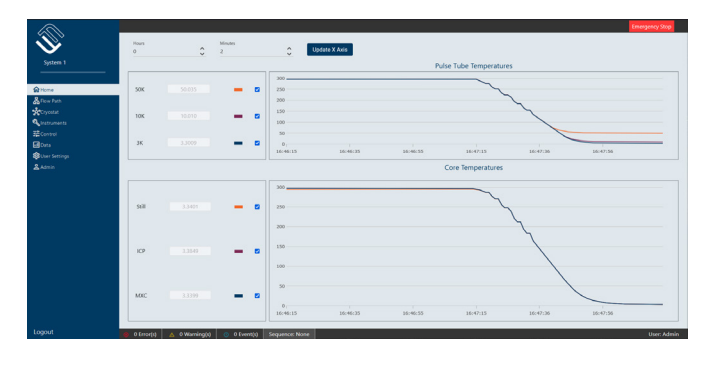
Smart Gas Handling System (SmartGHS) powered by Frostbyte Control Software

© Copyright 2024 FormFactor, Inc. All rights reserved. FormFactor and the FormFactor logo are trademarks of FormFactor, Inc. All other trademarks are the property of their respective owners. All information is subject to change without notice.