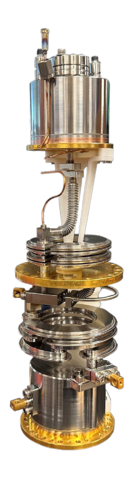
Aspect DR core with laser-weld heat exchangers provide high reliability with best-in-class cooling power and He3 efficiency.