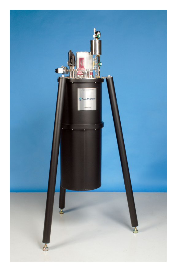
Model HE-3-SSV-PT-2 Cryogen-Free Helium-3 Cryostat

The system is supplied with a complete set of thermometers and heaters to monitor and control the temperature of the various stages of the cryostat. It also includes all the necessary valves and pressure gauges for safe and reliable system operation.