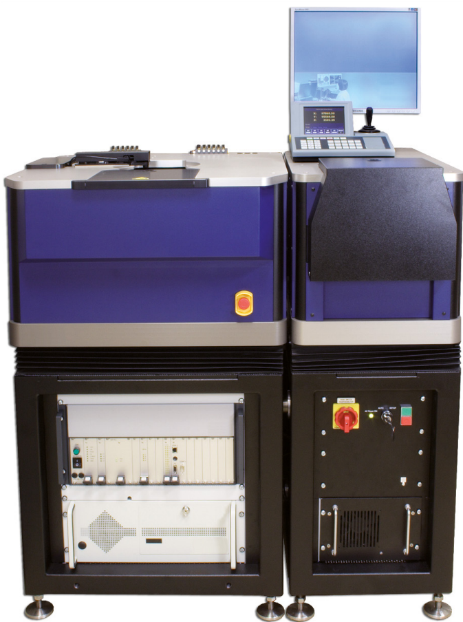
AP200DS BlueRay, equipped with wafer handling robot and integrated alignment camera.