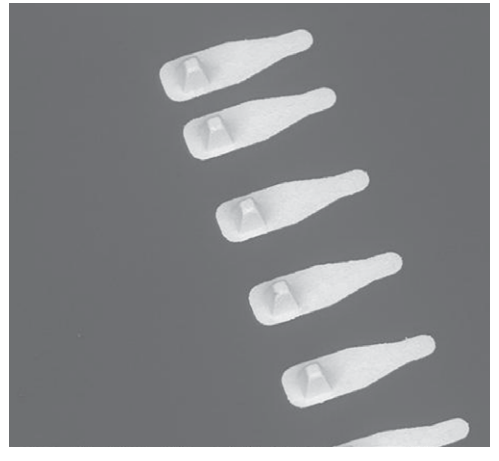
Pyramid Probe tips feature a 12 \mu m x 12 \mu m contact area for probing 30 \mu m x 30 \mu m aluminum and copper pads.